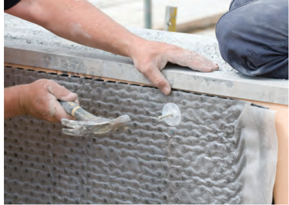
Fig 2: Fix Membrane