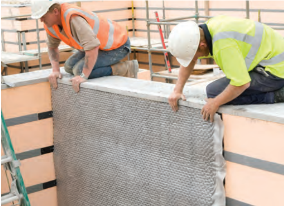
Fig 1: Position Membrane