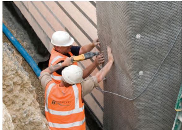
Fig 4: Fixing Membrane around corner