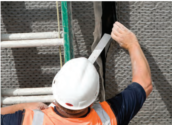
Fig 3: Tape Joints