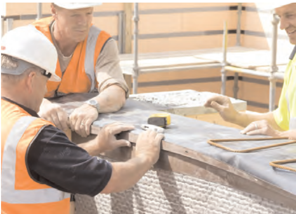
Fig 3: Capping Detail